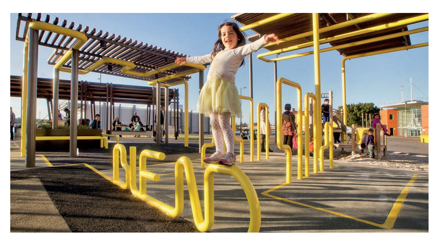
Harts Mill Surrounds

Competitiveness will he further strengthened by encouraging high quality and innovative design that creates beautiful buildings and public places. New and redeveloped precincts will have unique characters, with an urban form that builds the distinctive character and valued heritage of Adelaide's existing neighbourhoods. New and revitalised public spaces will be vibrant gathering place, with active edges and managed events programs supported by innovative, adaptable infrastructure.