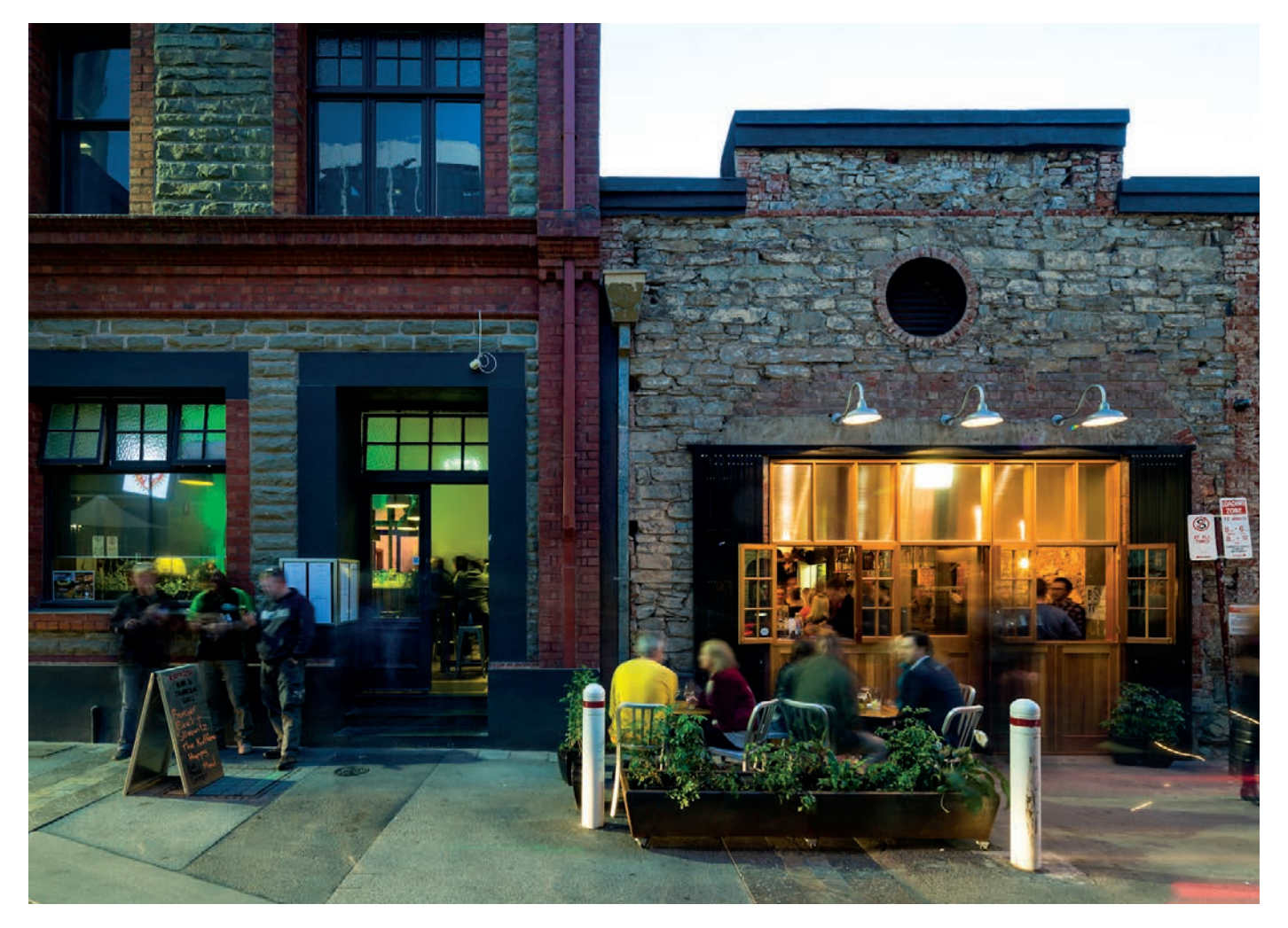
Peel Street, Adelaide

Adaptive reuse of heritage places also contributes to substantial environmental and financial savings in embodied energy by avoiding the creation of waste and the need to create more building materials. It also provides opportunities to assist local economies through employment and tourism and ensures that historic buildings continue to provide a sense of place for current and future generations.