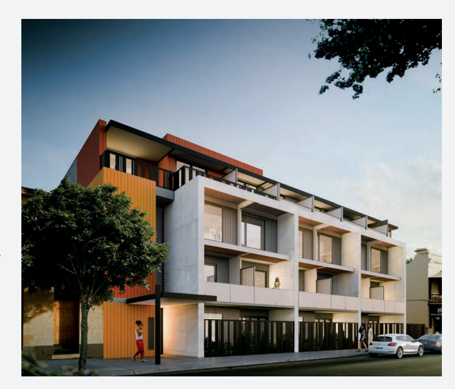
Artistic impression: Wharf 10, Port Adelaide

The design technique connects Dock 10 to the cultural and historical identity of its location. By homogenising the module formation of the facade, relief is given to the surrounding heritage buildings.