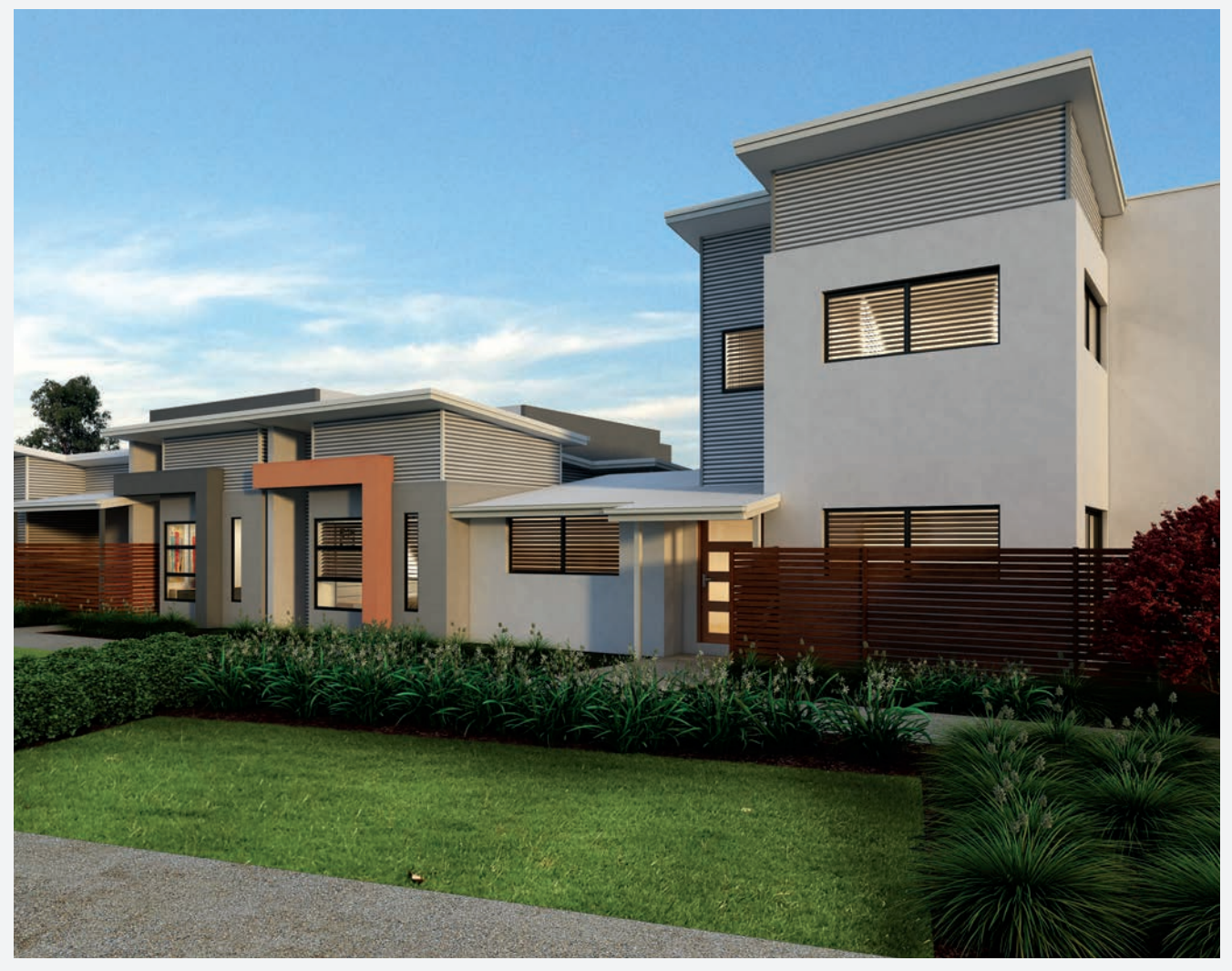
Artistic impression: Playford Alive

Playford Alive represents Renewal SA's determination to broaden the range of affordable new housing options for single-person and small households in these suburbs.